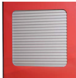
With graphic panel cut out