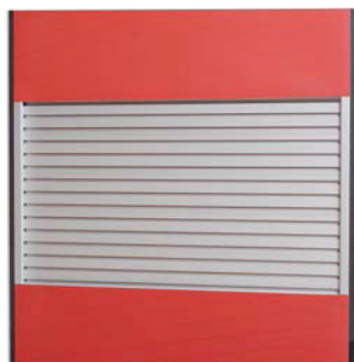
With corner trims