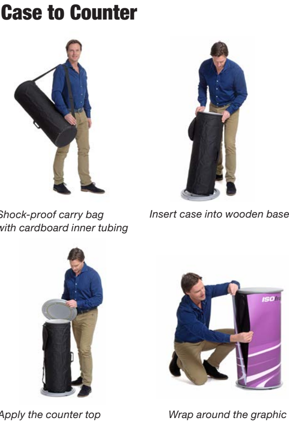
Shock-proof carry bag with cardboard inner tubing Insert case into wooden base Apply the counter top Wrap around the graphic