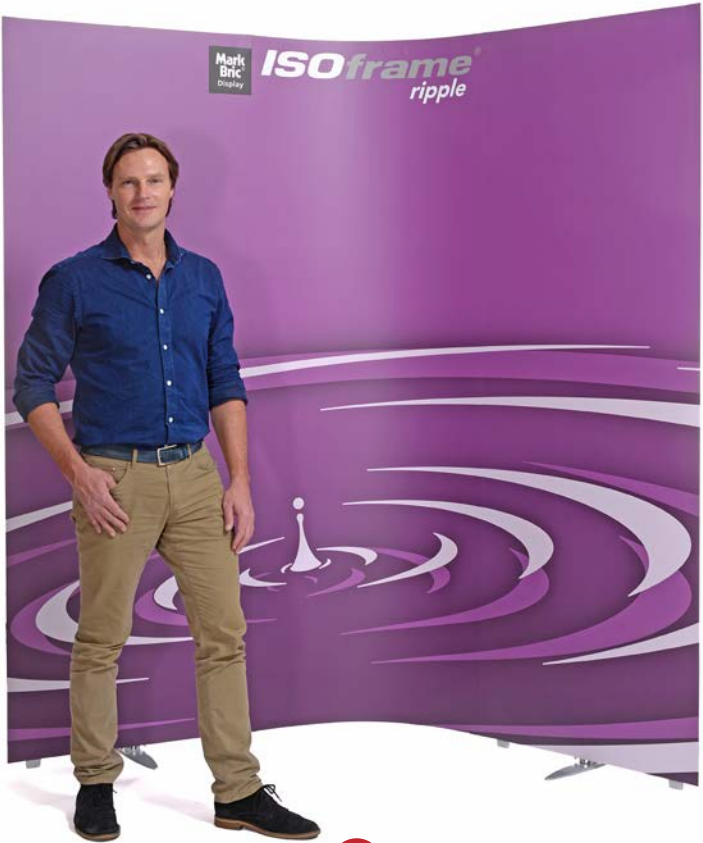
3 A complete 3-section display wall

The Ripple wall can be flexed into almost any shape you want and gives you maximum flexibility for reducing or enlarging the size of your display to suit your needs. Add or remove panels one-by-one as desired. Media screen attachments, spotlights and a unique case/counter solution are available as accessories. Its ability to fit into the boot of a small car makes it ideal for flyaway events and exhibitions. If simplicity, flexibility, speed of assembly and price competitiveness is what you want from a portable display system then the Ripple ticks all the boxes.