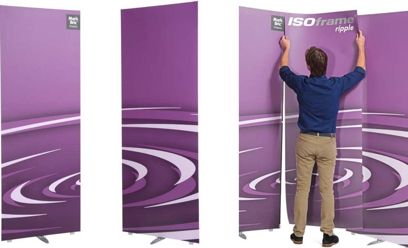
1 Two Ripple banner stands 2 Add a flexible link panel

Flexible and extremely cost effective, the ISOframe Ripple will literally change the shape of your portable display experience. The graphic panels can either be attached to a banner stand or used as a flexible link graphic, creating a clean seamless and contemporary portable display wall that provides a strong visual impact.